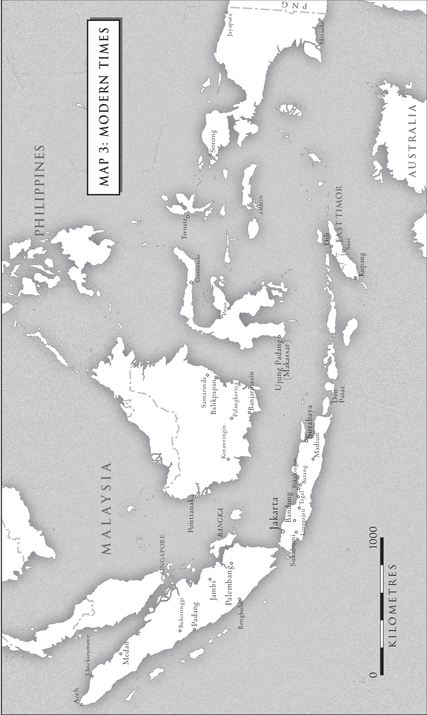
MAP 3: MODERN TIMES